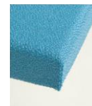
Pencil Radius Square