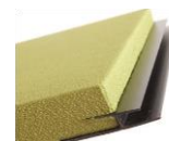
Concealed Spine (includes adhesive)