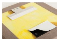
Mechanical "Z" clip (includes rail and Velcro)