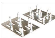
Impaling Clip (includes adhesive)