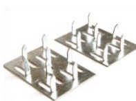
Impaling Clip (includes adhesive)