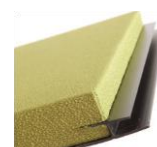
Concealed Spline (includes adhesive)