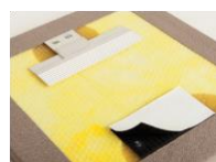
Mechanical "Z" clip (rail, Velcro)